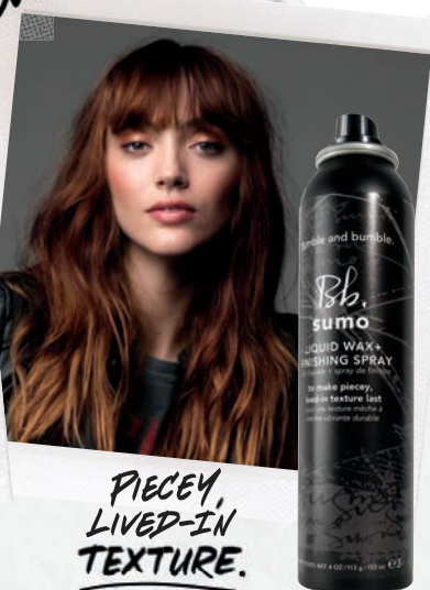
PIECEY, LIVED-IN TEXTURE. Sumo Liquid Wax+ Finishing Spray (for medium-to-thick hair) 4 oz. $32 | 2542293

*One per customer. While quantities last.