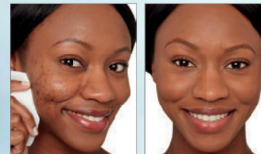
REAL REAL RESULTS BYE BYE PIMPLES