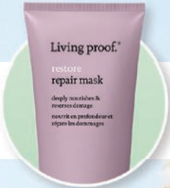
Restore Repair Mask repair + nourish 6.7 oz. $38 | 2558716