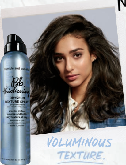
VOLUMINOUS TEXTURE. Thickening Dryspun Texture Spray (for fine-to-medium, healthy hair) 3.6 oz. $31 | 2516135