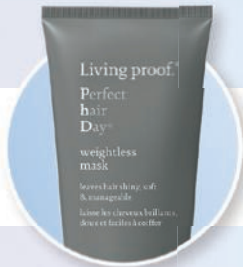
Perfect hair Day™ (PhD) Weightless Mask revive + add shine 6.7 oz. $38 | 2559646