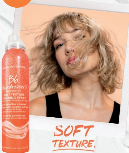
SOFT TEXTURE. Hairdresser's Invisible Oil Soft Texture Finishing Spray (for dry or damaged hair) 3.7 oz. $32 | 2560166