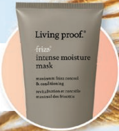
No Frizz Intense Moisture Mask fight frizz + smooth 6.7 oz. $38 | 2558719