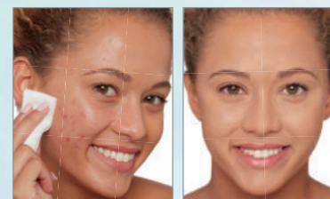
REAL REAL RESULTS BYE BYE OILINESS