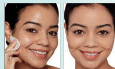
REAL REAL RESULTS BYE BYE PORES

it's your full coverage moisturizer—now in hydrating matte